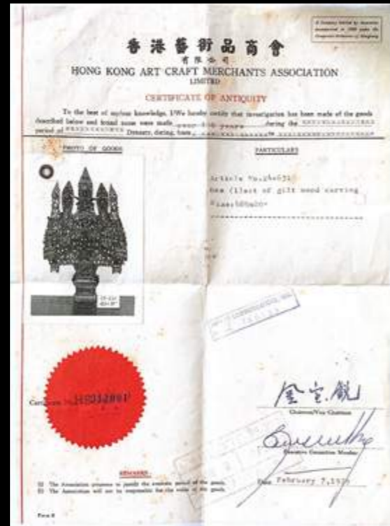
Certificate from Hong Kong Art Craft Merchants Association in 1979

中国 十九世纪 漆金木雕坐佛三清仙山 来源：瑞士私人珍藏 并于1979年获香港艺术品商会认证