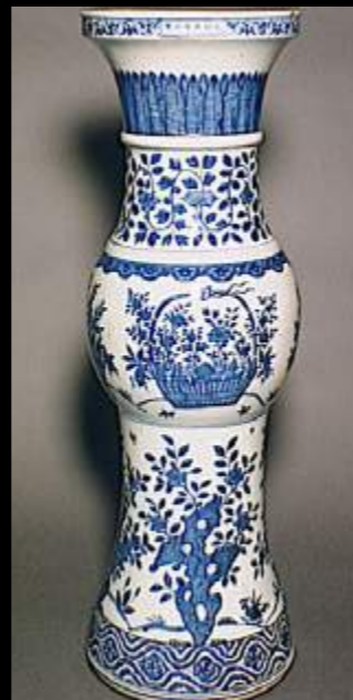
©DR Ernest Grandidier collection, Musée national des arts asiatiques Guimet, G 2289

来源：藏家的外交官叔曾祖父购于1875年北京 参考Ernest Grandidier收藏中纹饰相同花瓶， 巴黎吉美国立亚洲艺术博物馆编号G 2289