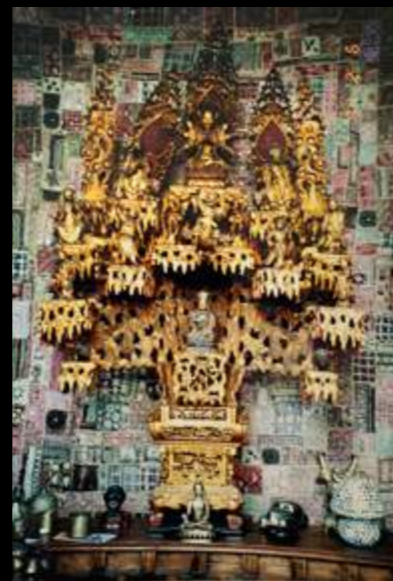
In situ photo